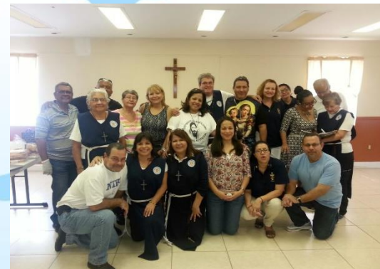
SAINTE BONIFACE GROUP