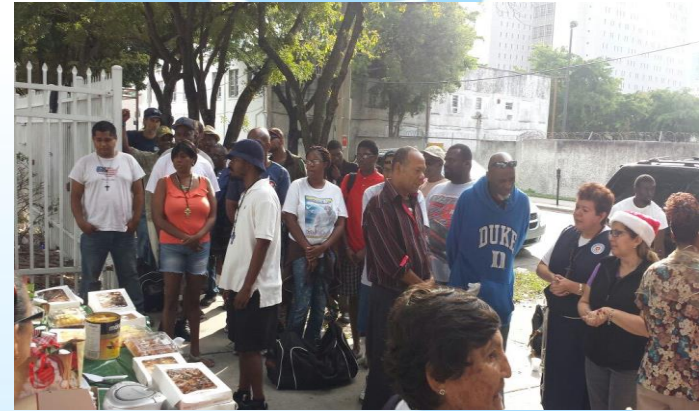
YELLOW HOUSE POINT