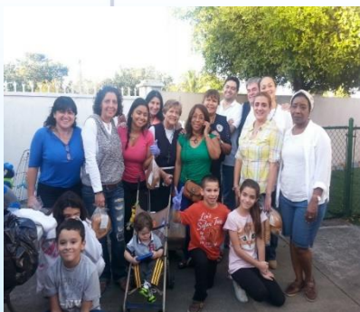
SAINTE BARBARA GROUP