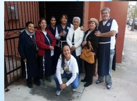
MEETING POINT Starting service at 07:30 a.m.